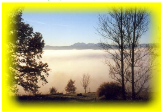
Dawn at Providence

We have ideal conditions for groups of up to 12 people